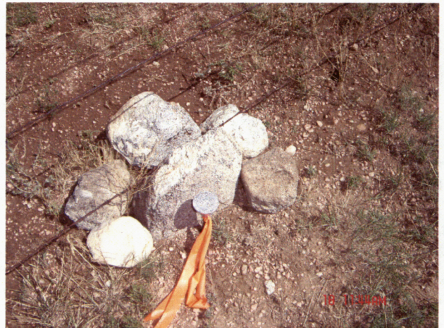
Found stone, set monument and ring of stones.